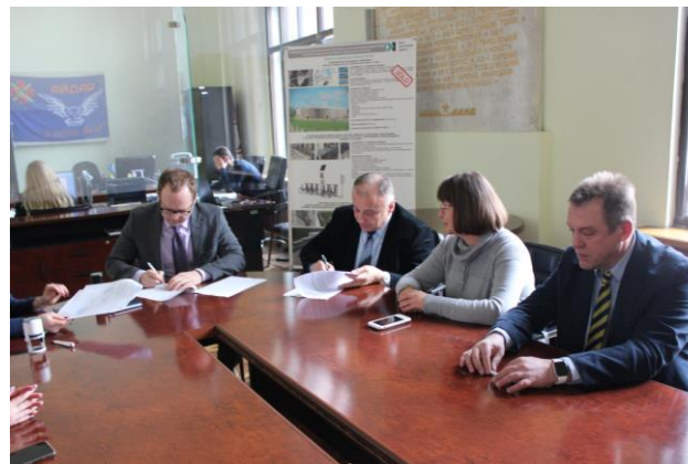
Cooperation agreement between Kyiv City State Administration, Kyiv Smart City Hub and SRI NASU-SSAU, 21.02.2018