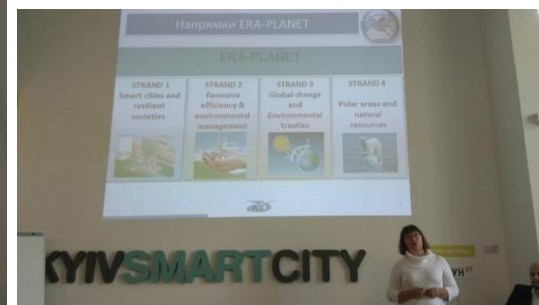
Air quality workshop organized by SRI NASU-SSAU in cooperation with Kyiv Smart city Hub, 26.04.2018